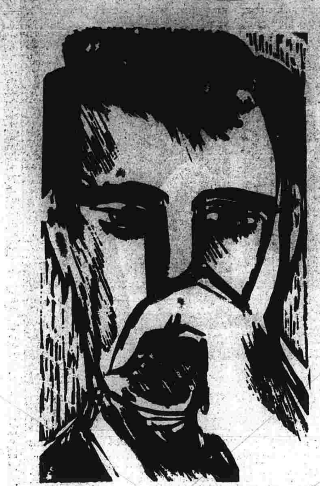
WOODCUT BY MANCHESTER'S DAVID HAYES

It is in this race, the nuclear race, that we are seeing the most dramatic and terrifying of all the things that are happening in the world today.