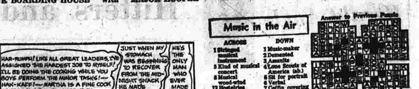
MUSIC IN THE AIR